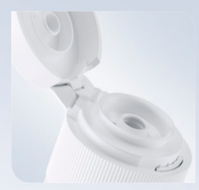
No unscrewing necessary