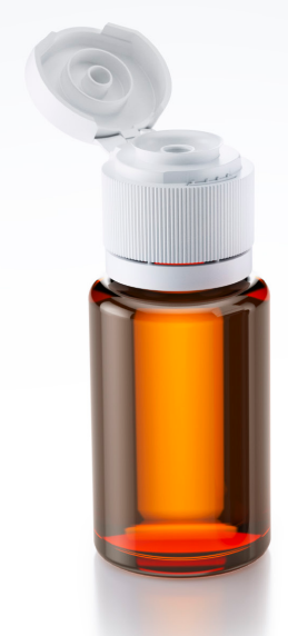
Simply press upwards to open

Upon initial opening, the seal falls into a pocket provided for this purpose. No unscrewing necessary.