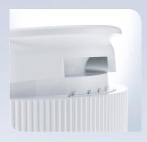
Tamper-evident seal remains in the closure